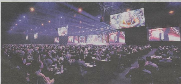
Last year, NHCCE 2023 attracted 4,000 delegates from across Southeast Asia.